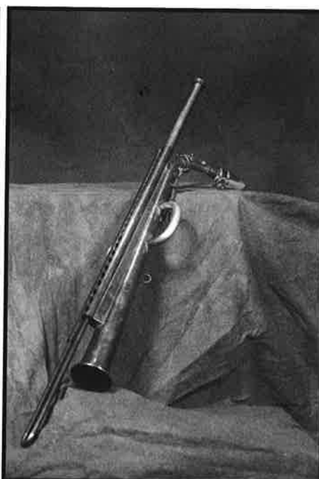
The Royal Slide Saxophone with slide extended